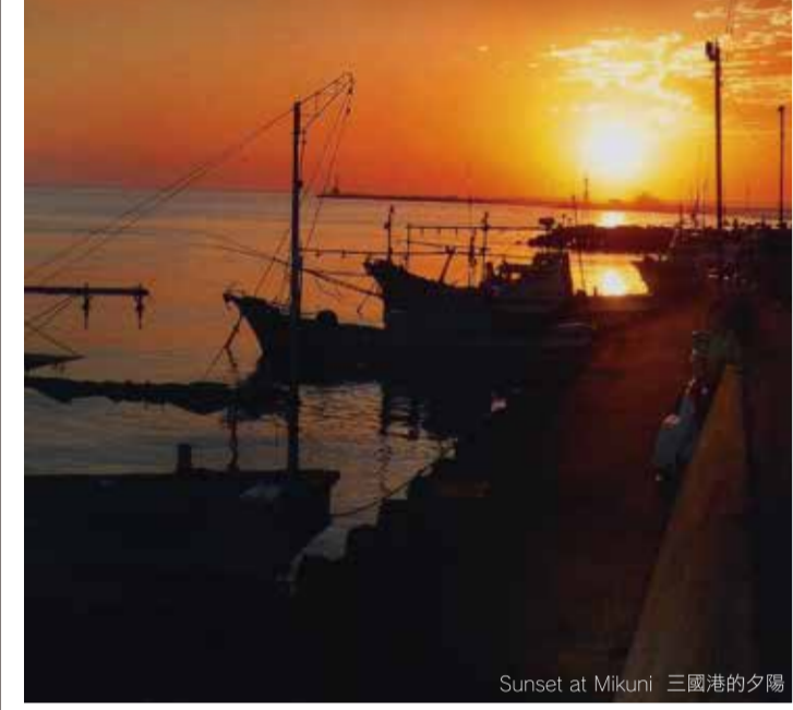
Sunset at Mikuni 三國港的夕陽