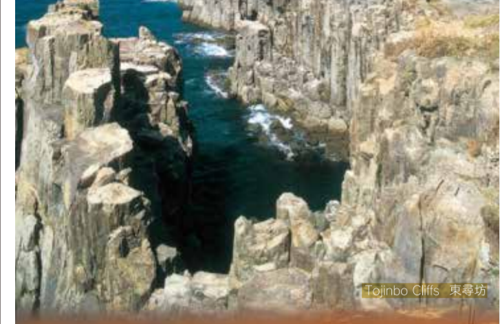
Tojinbo Cliffs 東尋坊